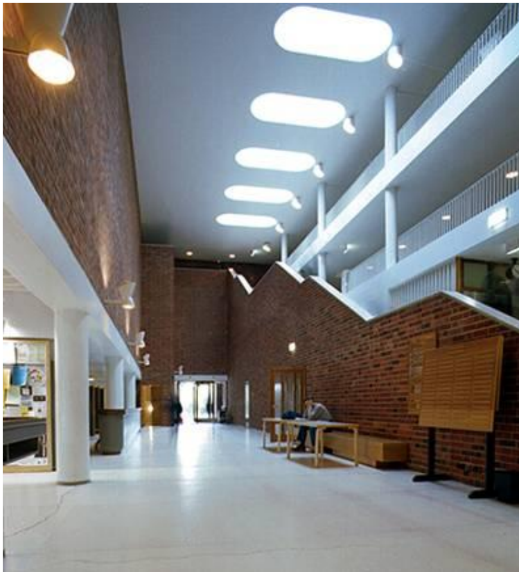
The main stair hall.

Not everyone considers Venturi's methods adequate although they belong rightly to the area of the theory of architecture. Manfredo Tafuri criticizes the way Venturi turns "fashionable' analytical methods" into 'compositive' methods 16 , but he does not reject Venturi's analysis totally. I also consider it usable, because in Aalto's case it is able to highlight the non canonical features of his architecture.