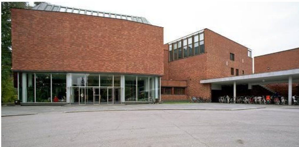
The main entrance facade. The brick wall is 'floating in the air'.

The festival hall consisted of two big lecture rooms and it was also designed to be hired out for public purposes. 8 Aalto emphasized its visual connection towards the town. The exceptionally symmetric entrance facade of the festival hall section really catches the eye. The high brick wall of this main facade seems to float on top of the large glazed walls of the foyer.