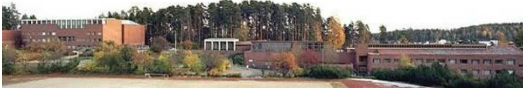
The main building seen from the interior of the campus.